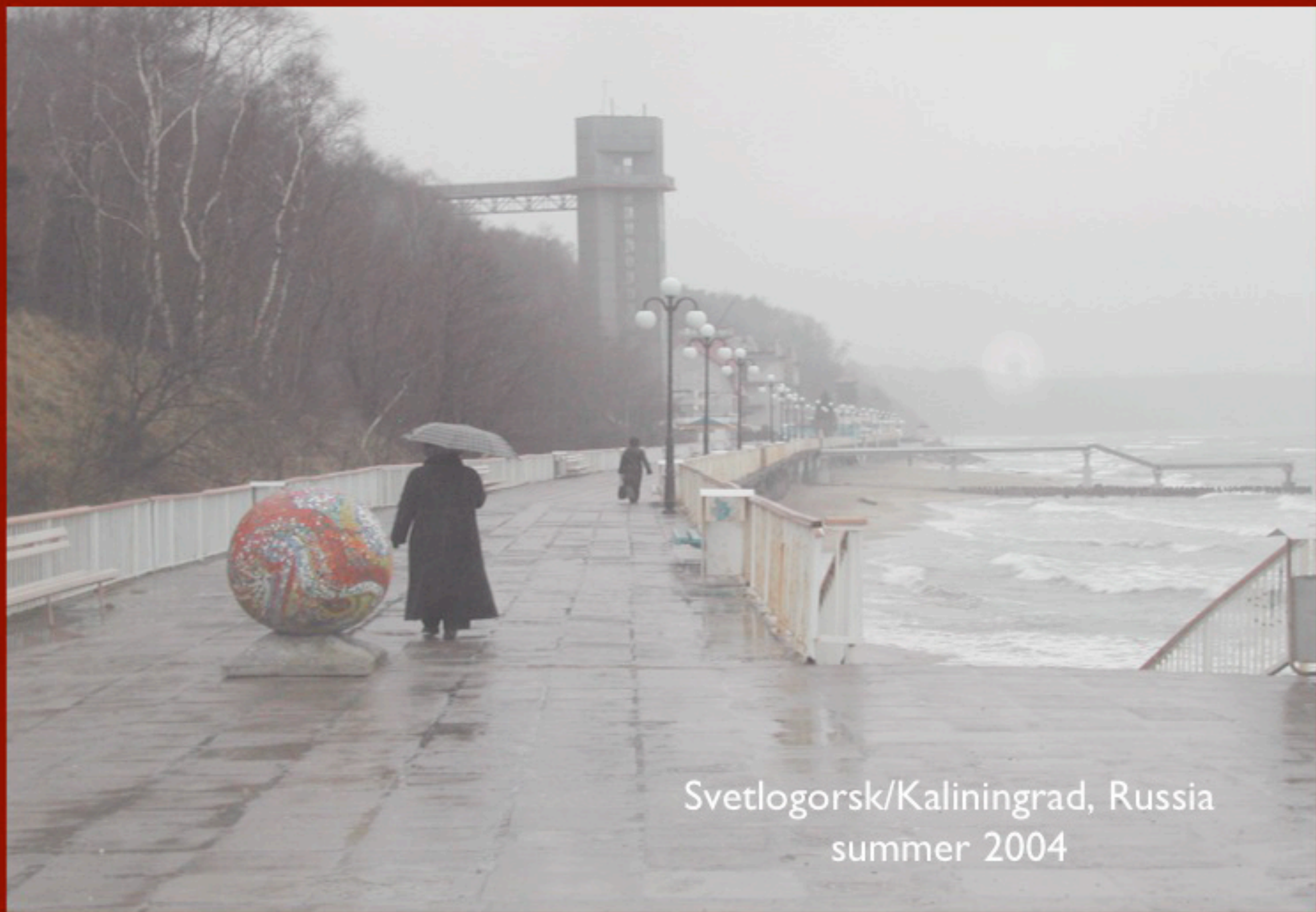
Svetlogorsk/Kaliningrad, Russia summer 2004