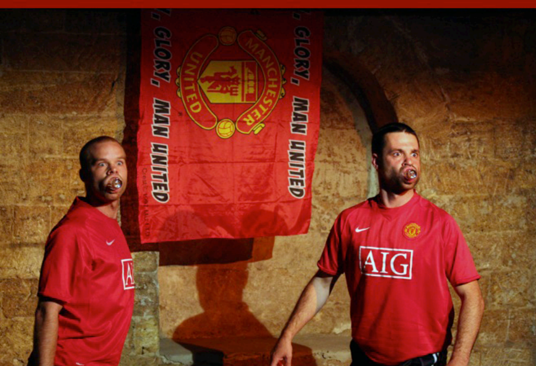
BEER TOURISTS (The Netherlands) theatre group WUNDERBAUM