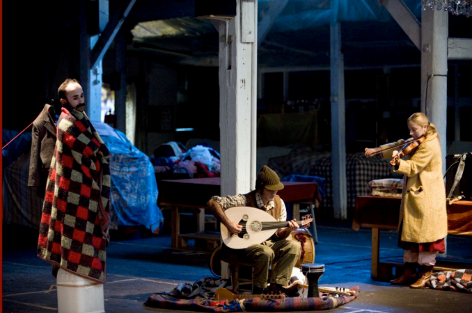
WAITING (Turkey) Tiyatro Oyunevi