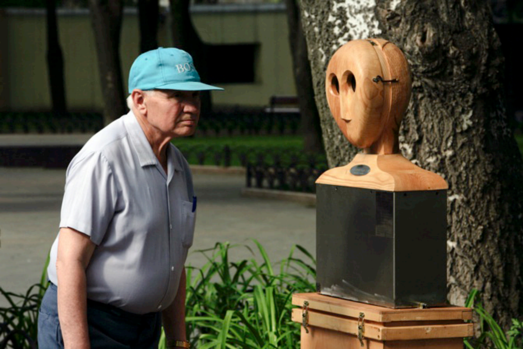
FANTOMAT (Sweden/Bulgaria) Odessa, Ukraina – maj 2008