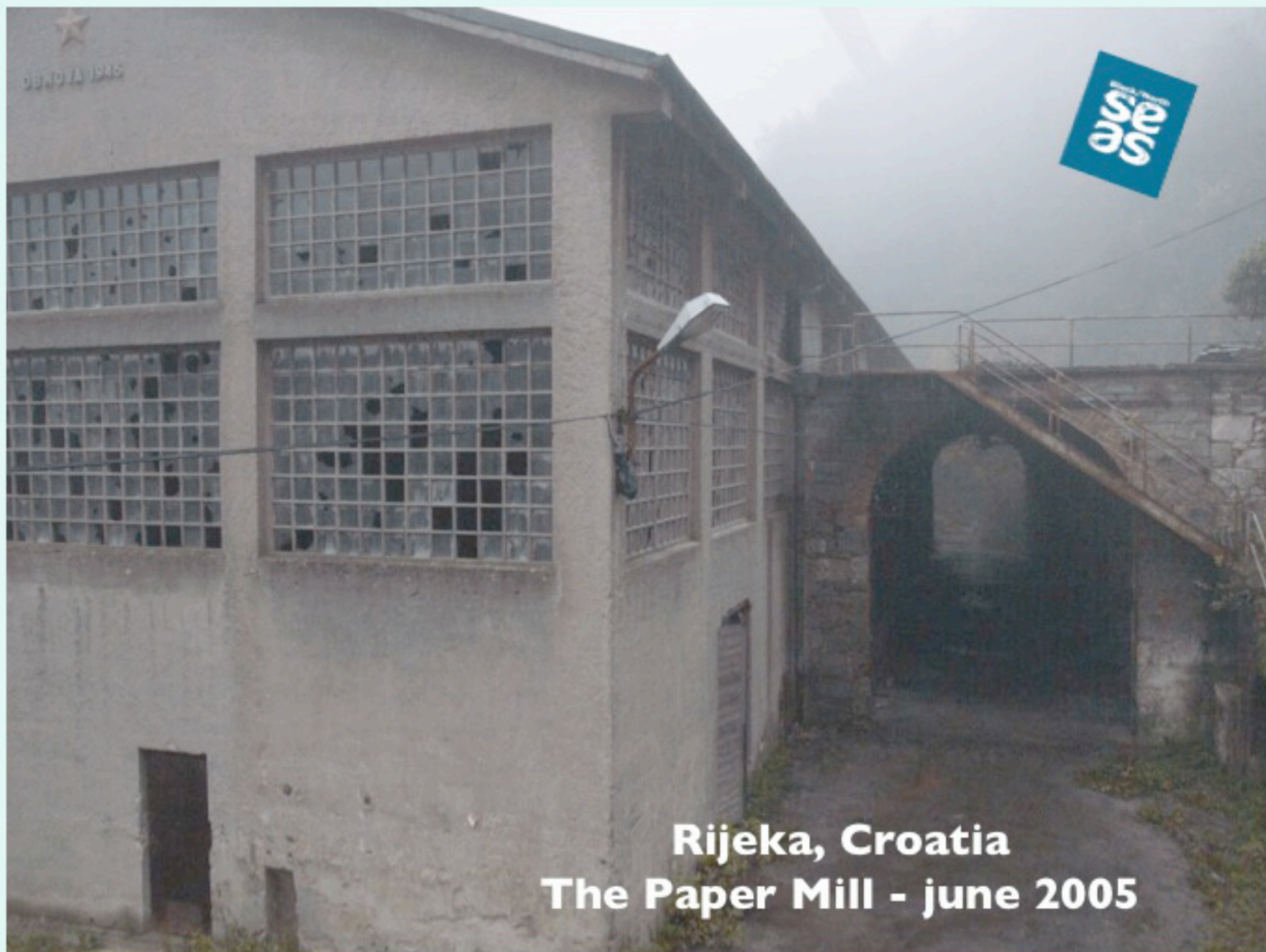
Rijeka, Croatia The Paper Mill - june 2005