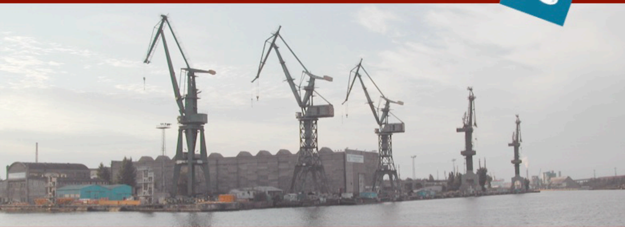
the shipyards in Gdansk, Poland - 2004